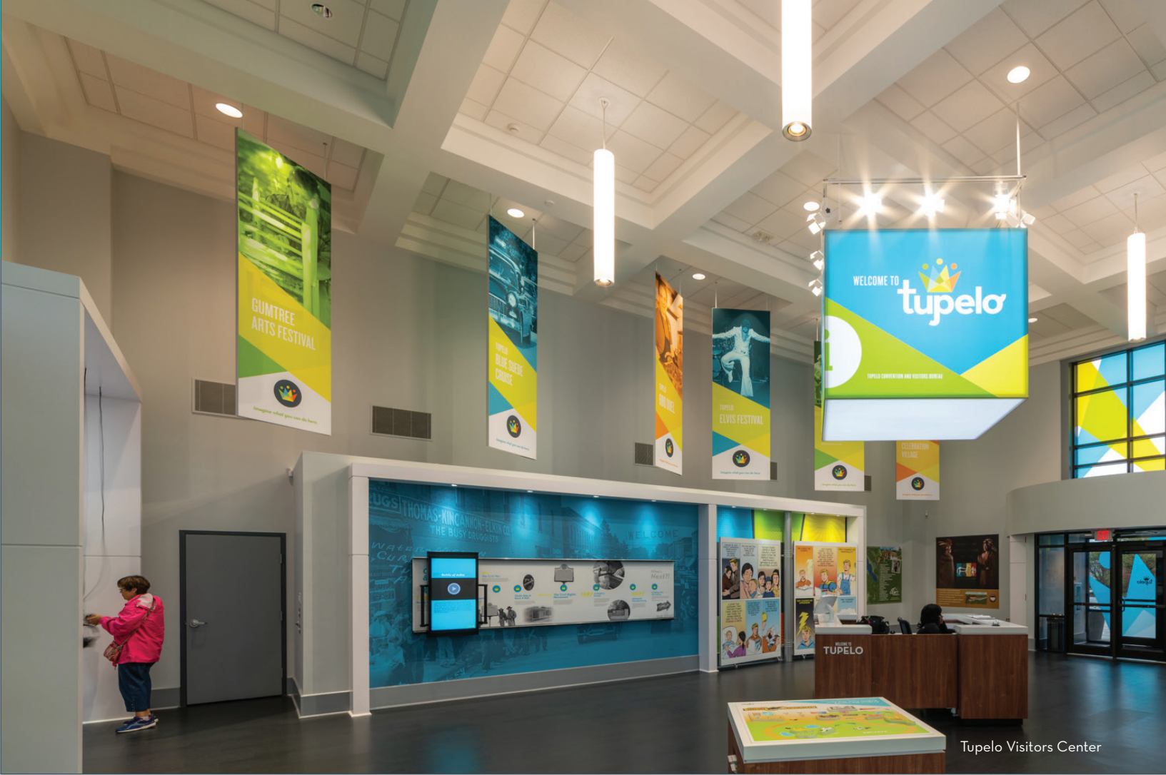
Tupelo Visitors Center

We're at your service and look forward to working with you on your next meeting, event, trade show, or convention.